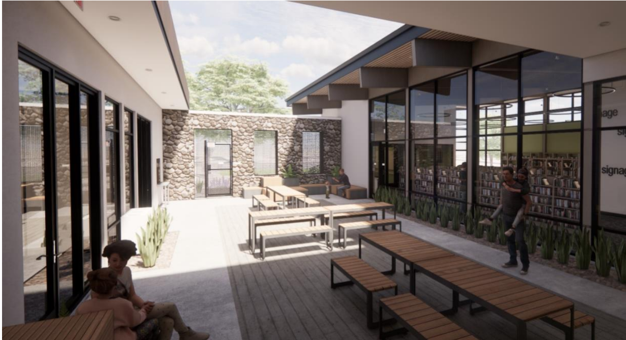
The Poet's Patio Architectural Rendering provided by Coar Design Group and EC Constructors