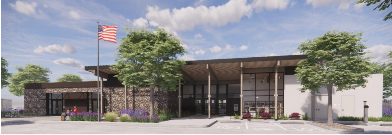
Main Entryway Architectural Rendering provided by Coar Design Group and EC Constructors