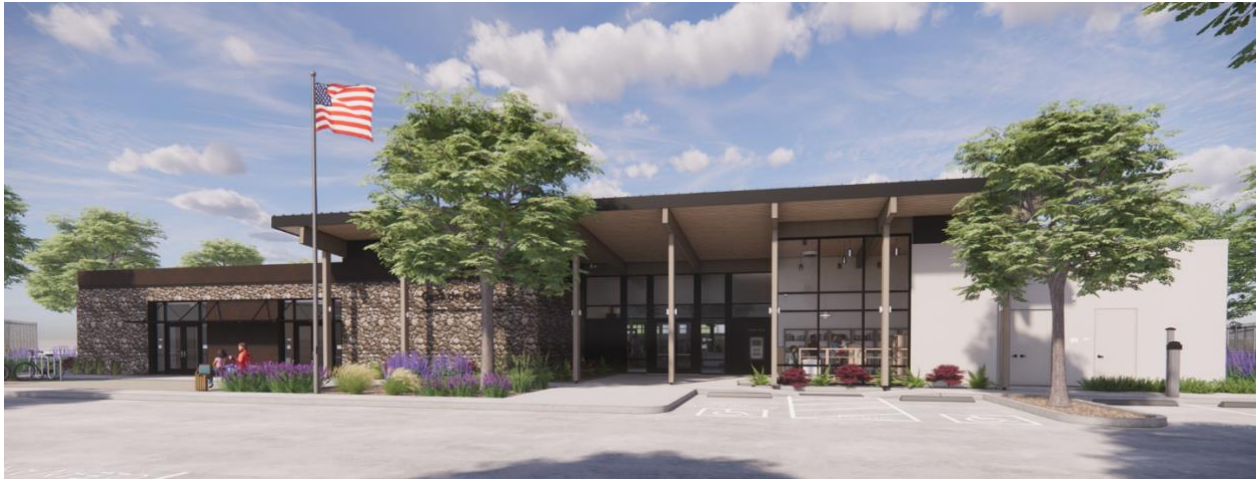
Architectural Rendering provided by Coar Design Group and EC Constructors